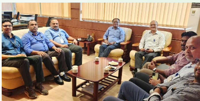
M & V Audit at BPCL Kochi Refinery on 6 th -8 th July 2023