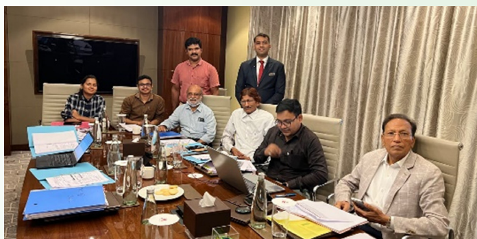
M & V Audit at Kochi Marriott on 24 th & 25 th July 2023