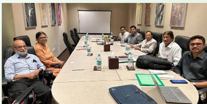
M & V Audit at Holiday Inn on 26 th & 27 th July 2023