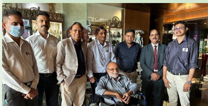
M&V Audit at Crowne Plaza on 28 th & 29 th July 2023