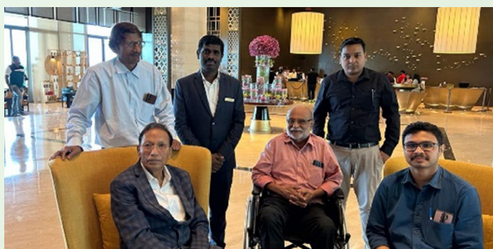
M & V Audit at Grant Hyatt on 30 th & 31 st July 2023