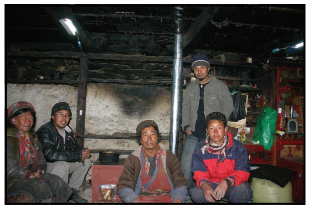
CSU stove installation in Nepal; January 2007

Smoke from traditional stoves that use fuels such as wood and dung is a serious health threat to women and infants. "They didn't have to tell you – you could see it in their faces," he says with a laugh. "They were really happy. They had been living for generations with kerosene, with these really dim lamps. They just couldn't believe their eyes."