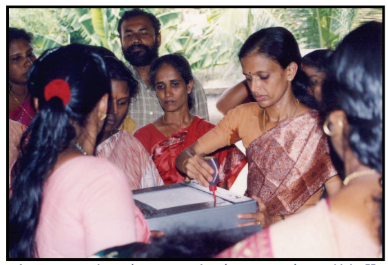
A master trainer demonstrating how to make an Urja II

empower women and improve their quality of life. This cost effective, efficient and environmentally friendly thermo-container is capable of saving around 75% of cooking energy while cooking rice, grains and similar foods. Women volunteers are selected from all parts of the state in association with the local governments, leading women's groups, women's self-help groups and prominent NGOs in their respective districts. Training on the fabrication of the device is provided to the volunteers and they are identified as local trainers, to provide further training to women's groups engaged in the fabrication of the devices. Women volunteers are also trained to conduct awareness classes in selected Panchayats for educating rural women about the opportunity and need for energy conservation, and the application of this device in their daily lives.