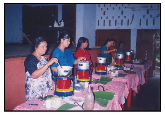
An energy efficient cooking contest after the clinic

Energy Clinic: EMC's experience shows that 10-15% energy savings can be achieved by simply creating awareness of energy efficiency. The Energy Clinic (known locally as Oorja Clinic) uses women volunteers as agents of change to educate housewives on energy conservation principles. EMC has trained 120 women volunteers throughout Kerala to organize demonstration classes on energy conservation in multiple villages, and is now in the process of selecting 300 more women volunteers for extending the reach of this programme in all the villages.