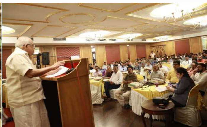
Hon. Minister for Electricity Shri. K. Krishnankutty inaugurating the Investment Bazaar at Palakkad