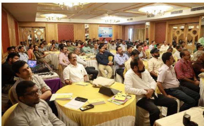
Exploring Investment Opportunities in Palakkad - A Snapshot

The event was a success with around 140 distinguished guests from various background like DCs, Industries, Financial Institutions, Energy Auditors, Technology Providers etc. Stalls were put up by various industries to show case their energy efficiency technologies.