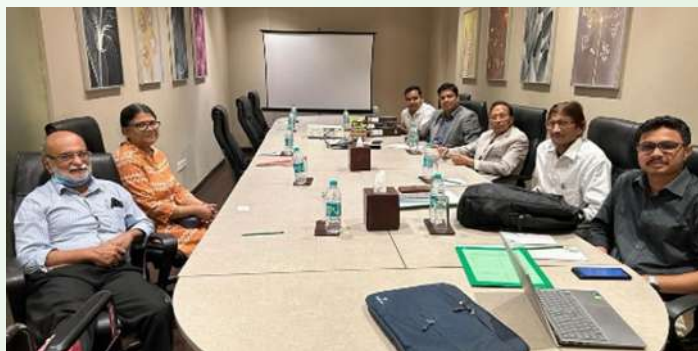
M & V Audit at Holiday Inn on 26 th & 27 th July 2023