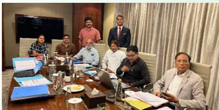
M & V Audit at Kochi Marriott on 24 th & 25 th July 2023

During the visit PAT cell team of EMC met with EmAEA engaged in PAT M&V of the DC, higher management, Energy Manager and Chief Engineer of the organisation and also had discussion on PAT scheme and Energy Conservation Act 2001 requirements.