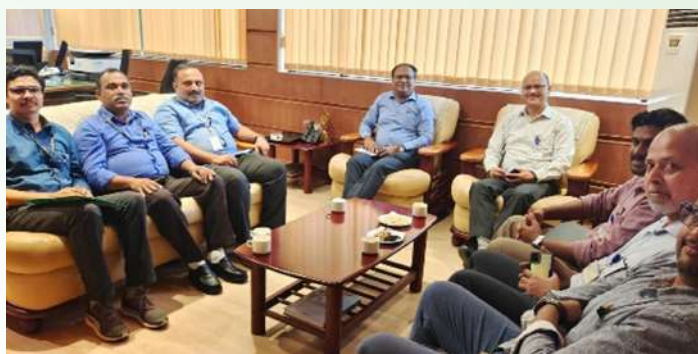
M & V Audit at BPCL Kochi Refinery on 6 th -8 th July 2023