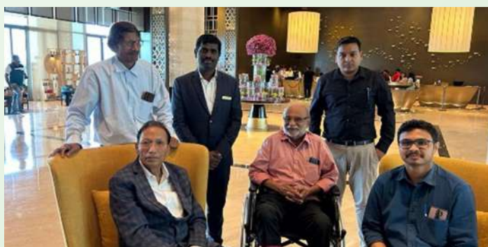
M & V Audit at Grant Hyatt on 30 th & 31 st July 2023