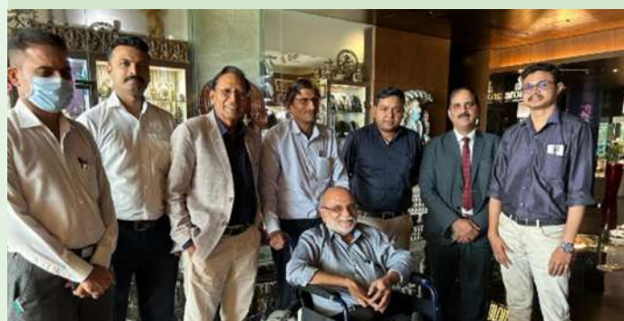
M&V Audit at Crowne Plaza on 28 th & 29 th July 2023